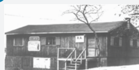
1943 - The RA Lodge located off Wellington Street where Library and Archives Canada is now located.