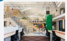
2018 - House of Sport official opening