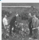
1953 - The RA broke ground on a new building on a plot of land near the Rideau River