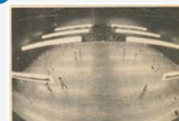
1978 - A "fish-eye" view of the RA's new badminton facility