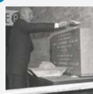
1958 - Prime Minister John Diefenbaker laid the cornerstone on the W. Clifford Clark Memorial Recreation Centre