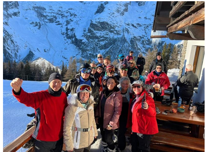
Jan. 31-Feb. 9: Courmayeur, Italy - Weeklong trip to Chamonix, France