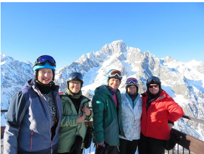
Jan. 31-Feb. 9 – Weeklong trip to Chamonix, France