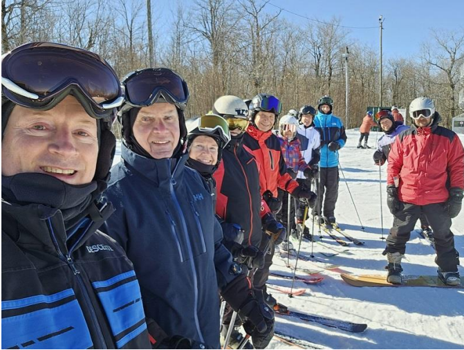
Camp Fortune, Mar 21, 2025

As I sit writing this on a 30C day, it's hard to think that in three months we will be skiing. Last year, our downhill season got a great start on the first week of December, and we skied right through to mid-April. In fact, we actually got to ski our full planned ski calendar and a few dates after – something that we haven't been able to do in quite a few years due to early Spring weather. Let's hope for an early start this season and see if we can beat last season's run into Spring!!