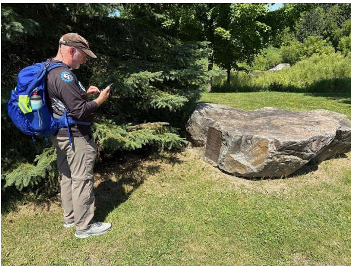
July 23 – Hike, Poet's Pathway, Stage 2