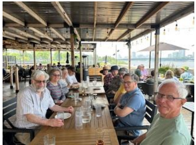
June 7 – At Tavern on the Falls after GG tour