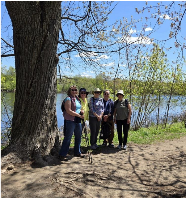
May 10 – Hike along Rideau River