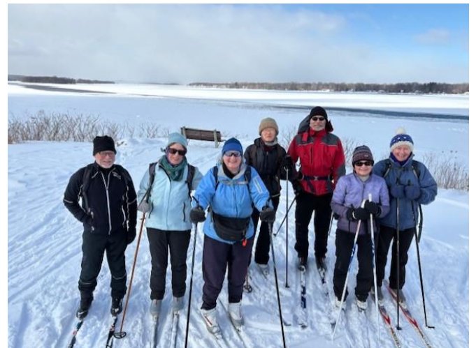
Feb. 6 – XC ski on Heritage Trail East