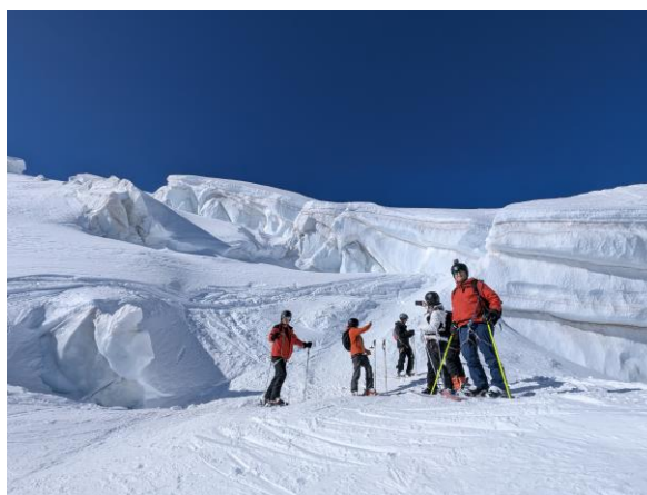
Jan. 31 – Feb. 9 – Weeklong trip to Chamonix, France

Your file will be downloaded to your directory "Downloads."