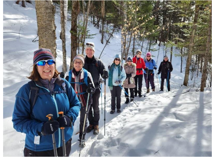
Feb. 2024 – Hiking at Far Hills Inn mid-week

We are currently working on returning to the Laurentians. This trip is being planned for sometime in February, 2026. Stay tuned for more information.