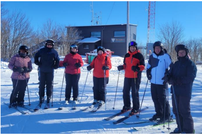
Jan. 24 – Fortune Friday