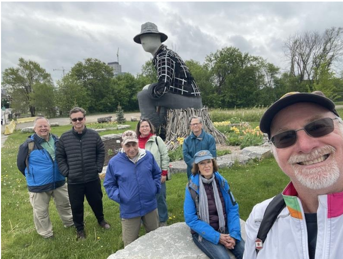
May 21 – Hike on the Gatineau Cultural Trail

Hello all you hiking and cycling enthusiasts! We are now embarking on the RA Ski Club FALL 2025 hiking and cycling schedule. Huge thanks to all our ski club volunteers who stepped up to lead hike or bike outings. Weather permitting, we will hike right through to November.