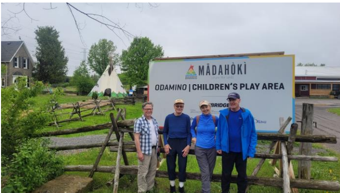
May 29 – Hike to Madahoki farm