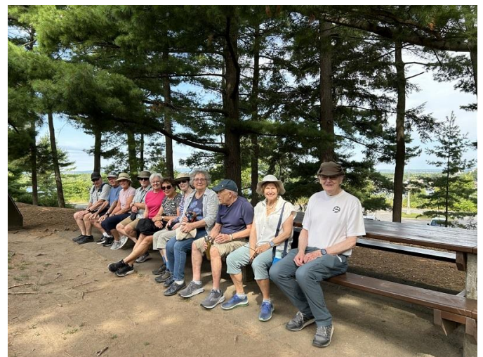
Aug. 23 – Walk to ambassadors' homes