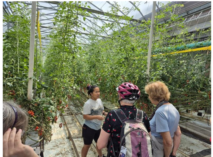
Aug. 20 – Biking on Osgoode trail, and visiting SunTech tomato plant