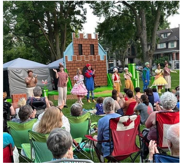
July 14 – Company of Fools “Comedy of Errors”

After, we headed to Father & Son's pub by Ottawa U.