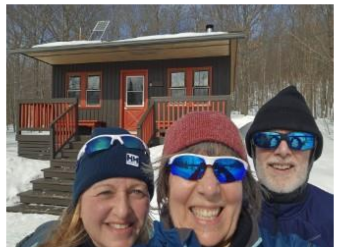
Mar. 8 – XC ski to Lusk cabin