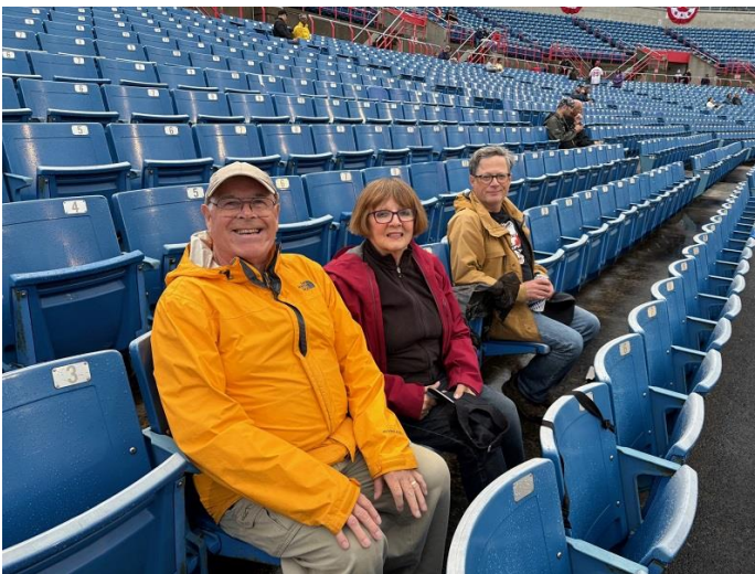
June 27 – Titans baseball game