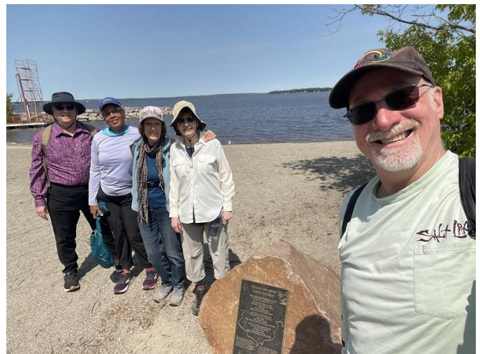
June 14 – Hike, Poet's Pathway, Stage 1