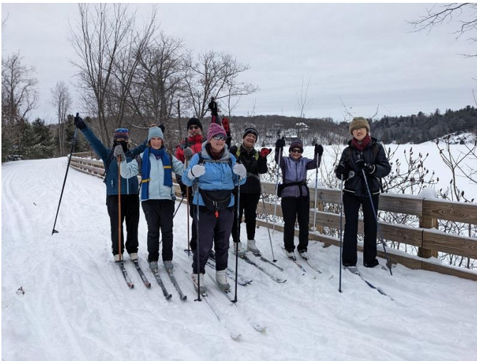
Jan. 30 – XC Ski on Chelsea railway track