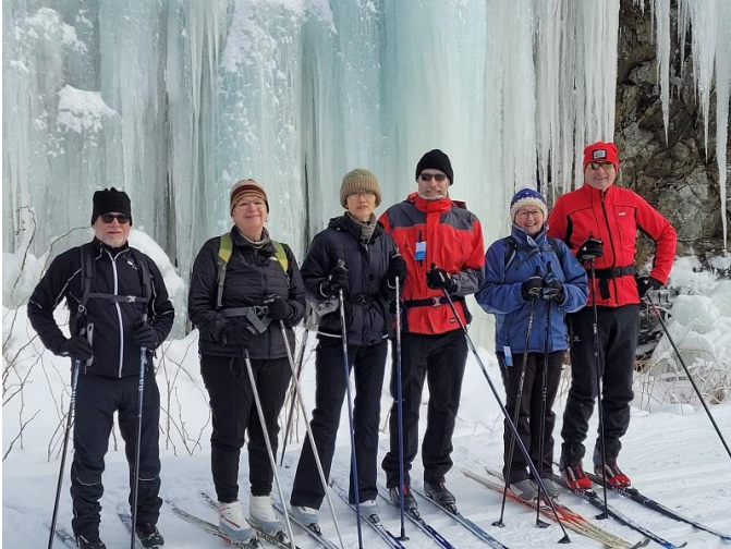
Jan. 26 – XC ski to Pink Lake

We welcome skiers of all levels although skiers are expected to have some skiing experience. If you are looking for a way to consolidate what you have learned in your lessons or are looking for a friendly group to ski with, please join us. The first few outings are usually on easy trails to allow everyone to ease into the ski season. Gatineau Park does have hills so you should ensure that you can comfortably execute a snowplow stop and a snowplow turn before skiing there. The Greenbelt and urban trails are generally more forgiving in this respect.