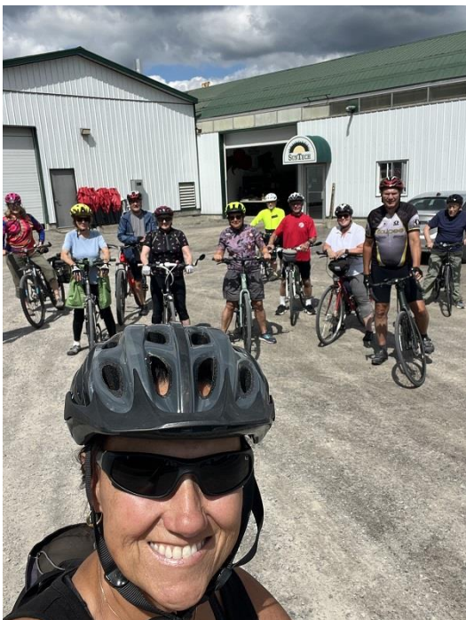
Aug. 20 – Osgood rail trail bike trip, visiting SunTech tomato plant

Please remember to confirm your participation at hikes-2025@raski.ca . This helps the leader to know who and how many are coming. Bring water and dress appropriately for the weather and terrain. Enjoy and spread the word about the RA Ski Club with your friends.