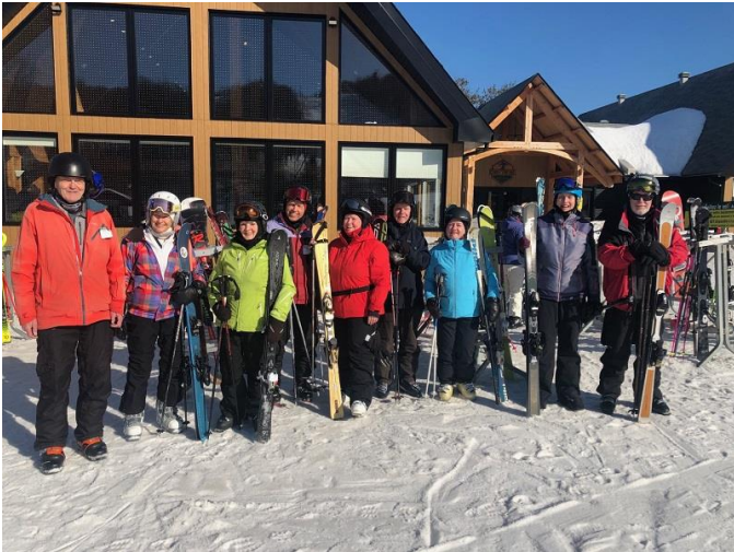
"Fortune Fridays" March 14, 2025

Our downhill day program will get you up & down more hills and to more local destinations than any other ski club in town. Between our weekly Meet n'Ski days to all local hills, our "Fortune Fridays" destination to Camp Fortune where many of our members have season passes, and our last-minute "Pop-Up" destinations that take advantage of special offers, good ski conditions, or just the whimsy of one of our members that plans a fun-filled day....we'll have it all mapped out for you.