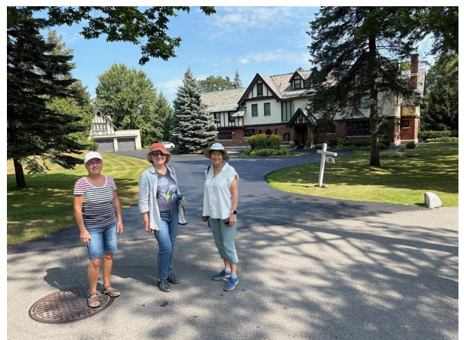
Aug. 23 – Spanish ambassador's home on tour of ambassadors' residences