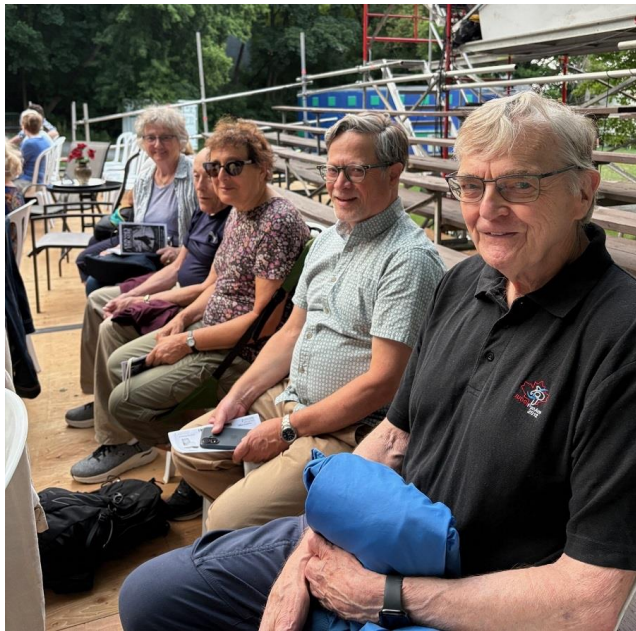
Aug. 5 – Watching Odyssey Theatre in Strathcona Park