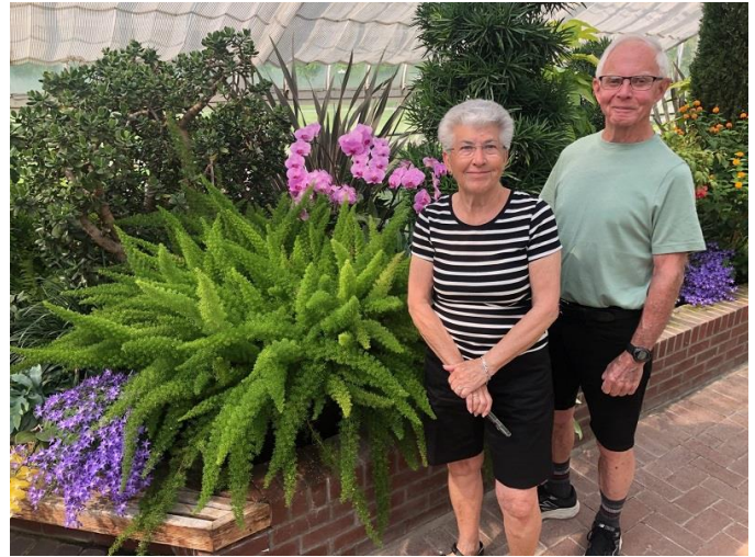
June 7 – Tour of Governor-General's residence & greenhouses