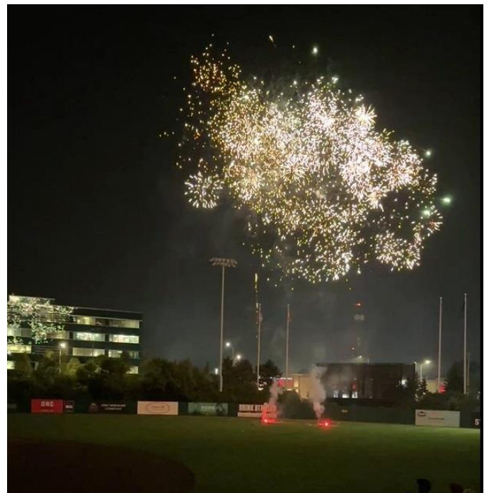
Aug. 8 – Fireworks after the Titans game.