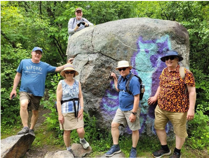
June 25 – Mud Lake hike