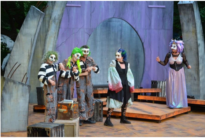
Aug. 5 - Odyssey Theatre "A Girl with No Hands"