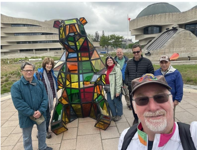
May 21 – Hike, Gatineau cultural trail