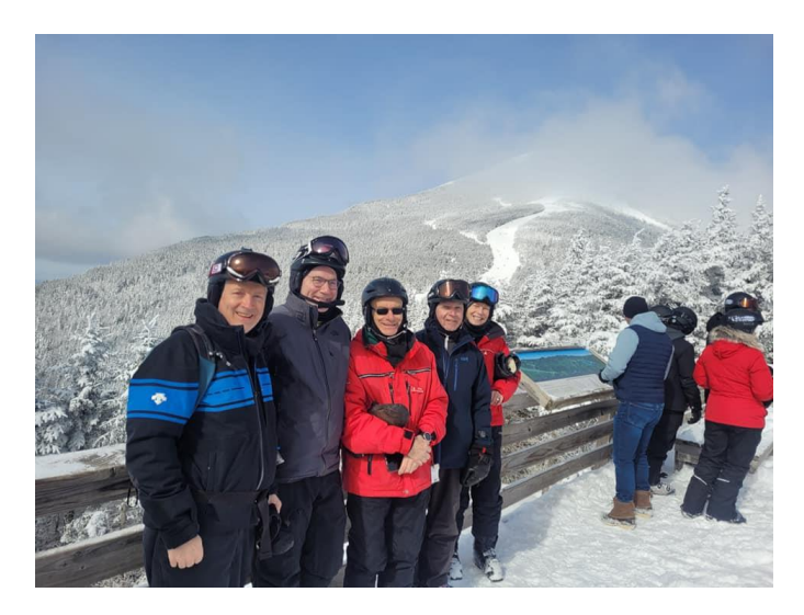
Feb. 2023 - Whiteface, NY