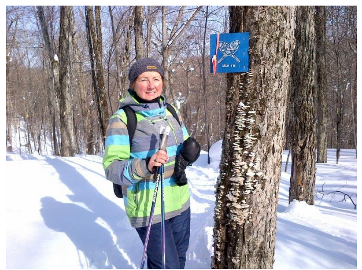
Feb. 2014 - Snowshoeing at Val David