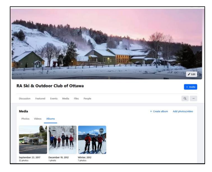
RA Ski Facebook page

Visit us on Facebook to learn about upcoming events, read members' comments, and much more! Go to RA Ski and Snowboard Club of Ottawa and ask to join.