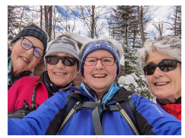
Feb. 2024 – RA skiers at Far Hills