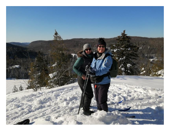
Feb. 2020 - Val David, Que.