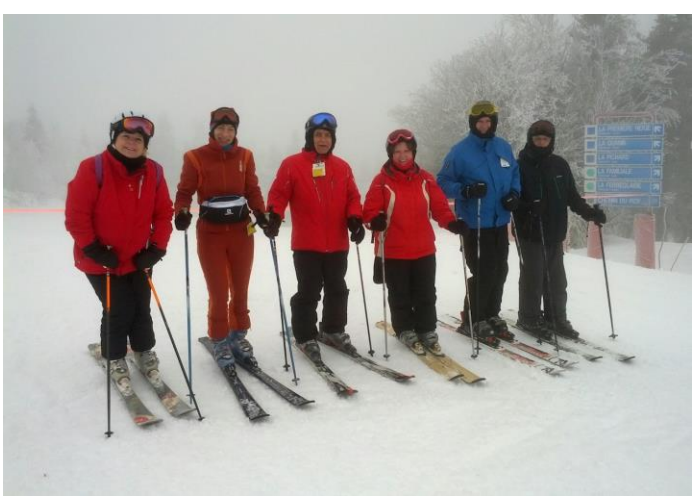
Feb. 2017 - Mont Ste-Anne, Que.