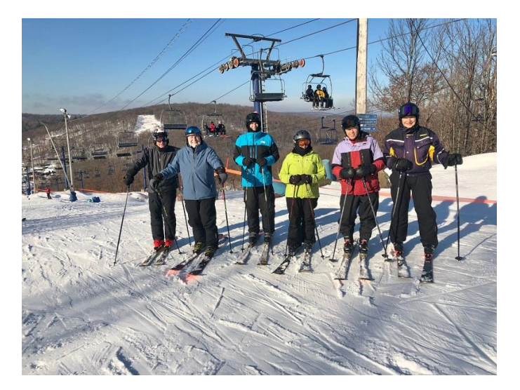
Dec. 16 - Fortune Friday, our first Downhill ski of the year

The Grinch took all our snow away for the Christmas holidays but snow is now on the way and all local hills are now 50%-100% open.