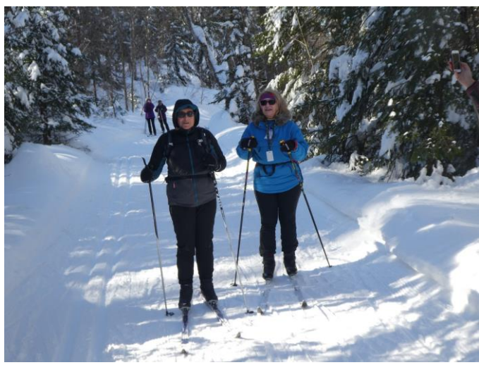
Feb. 2019 - Val David, Que.