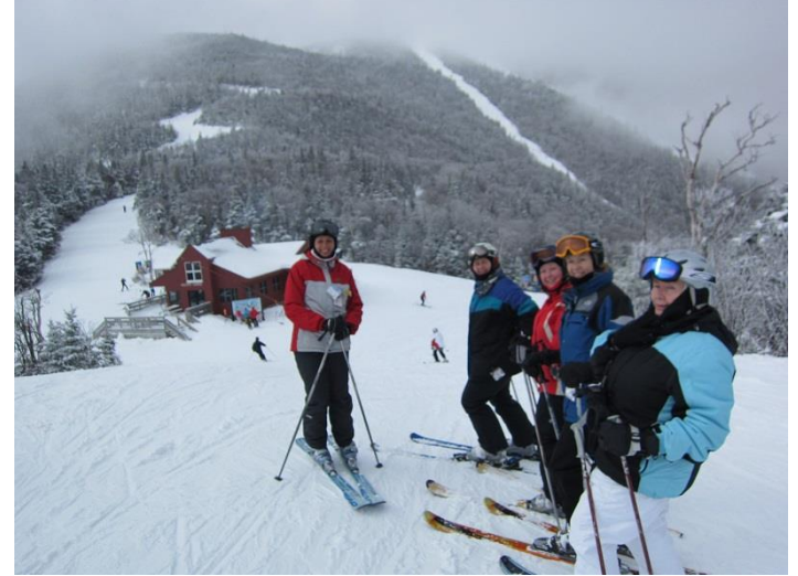
Mar. 2012 – Sugerbush, Vermont