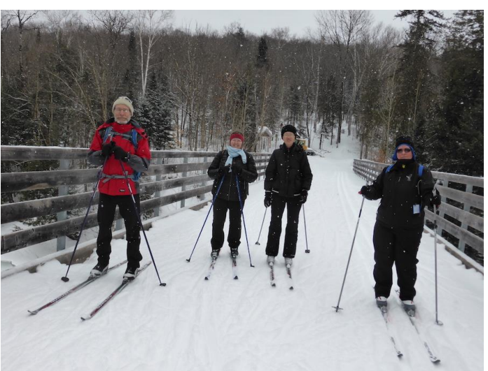
Feb. 2017 – Grand Lodge, Tremblant