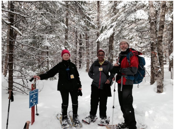
Feb. 2017 – Snowshoeing at Mont Ste-Anne