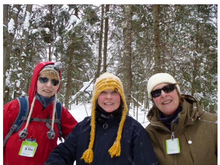
Feb. 2015 – Snowshoers at Tremblant