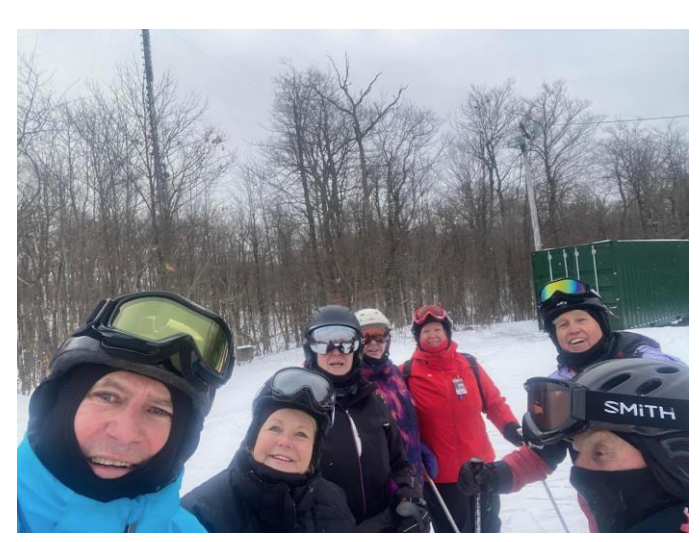
Jan. 5 – Fortune Friday

So, get those skis out and let's enjoy whatever ski conditions come our way.