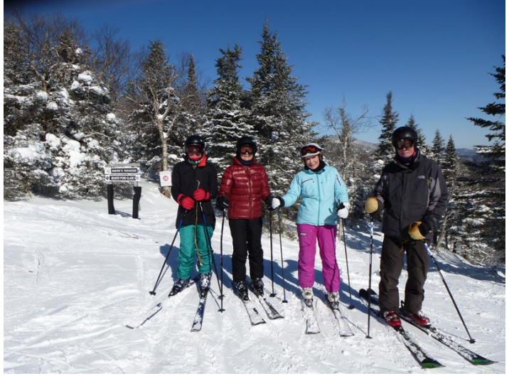
Mar. 2015 – Jay Peak