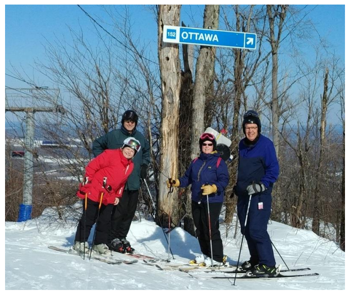
Feb. 2020 - Bromont, Que.