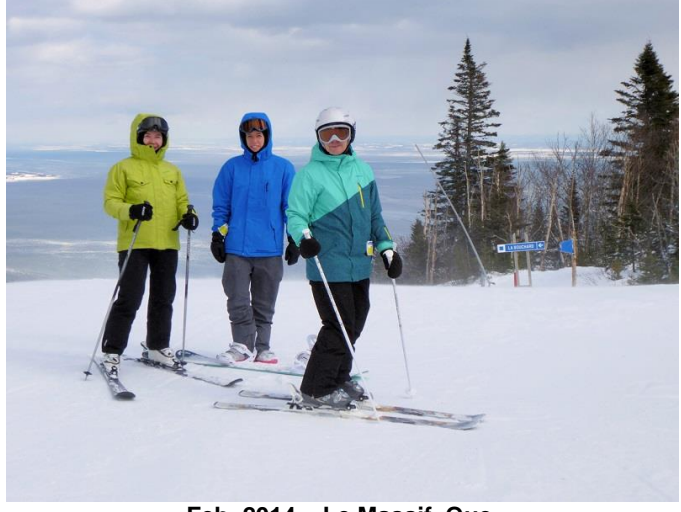
Feb. 2014 – Le Massif, Que.