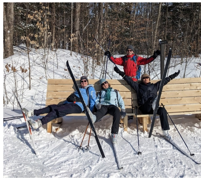
Feb. 26 – XC ski to Pink Lake