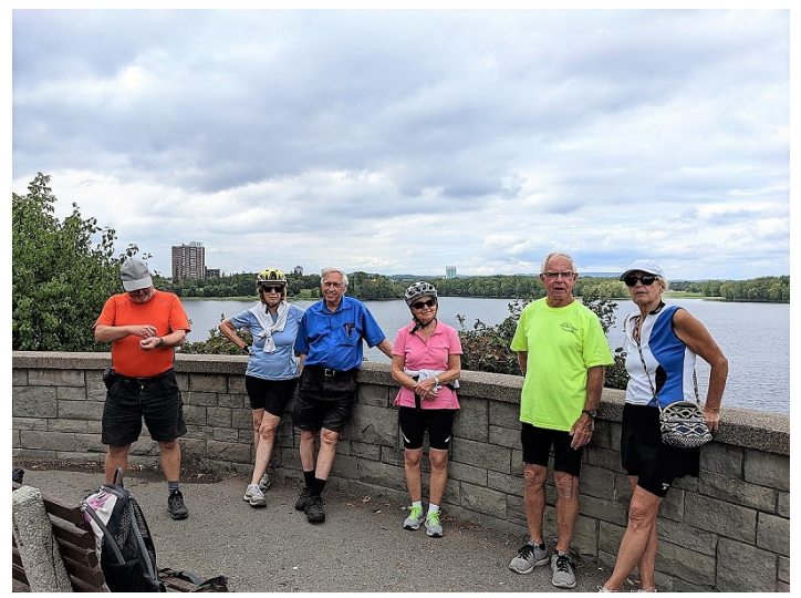
Sept. 12 2022 – Cycling to Tavern on the Falls