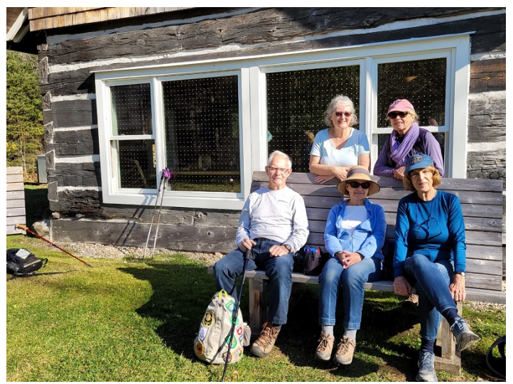
Nov. 2022 – Hike to Healey cabin