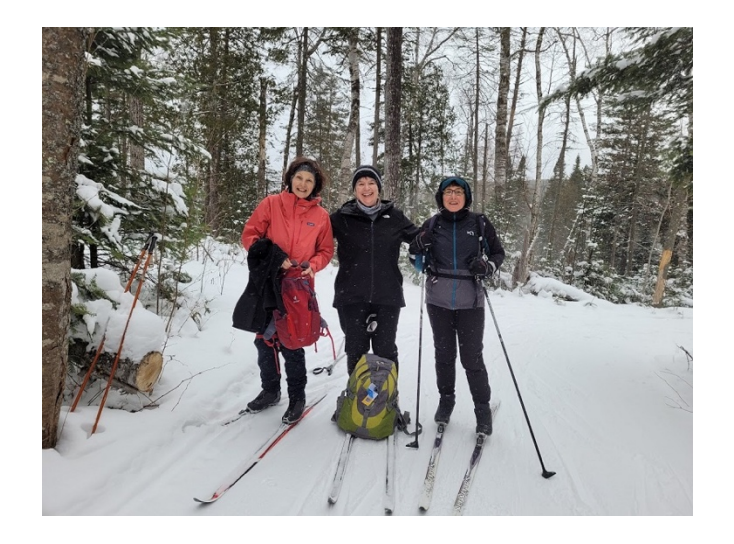
Feb. 2023 - XC skiers on Lake Placid trip

Having skied Whiteface not that many years ago when it was sarcastically called "Iceface", the improvements in snowmaking and lifts are very noticeable. Driving conditions were good on the way back, and we all made it home safe & sound.