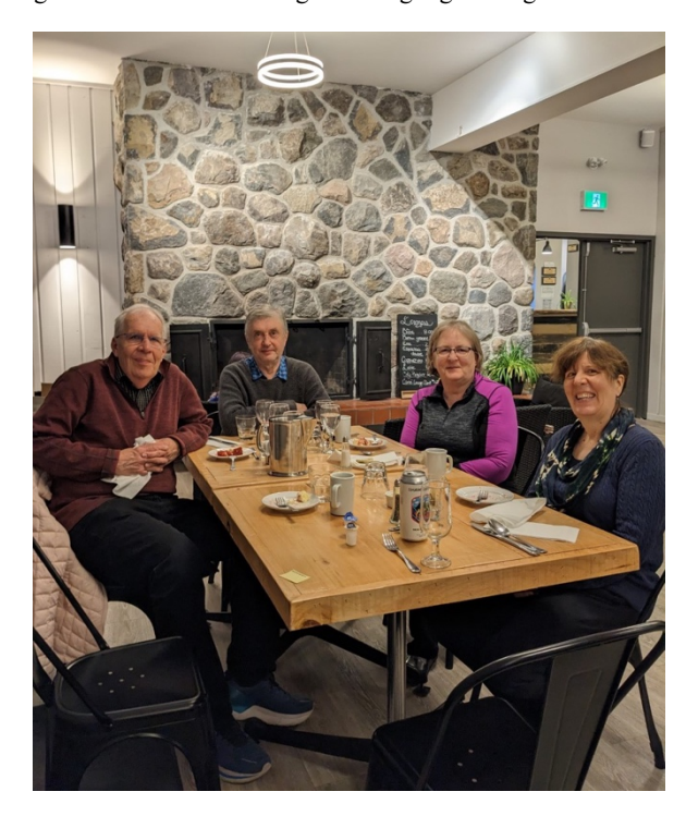
Dinner at Far Hills Inn

RA skiers and snowshoers returned to Far Hills Inn this February 8-10 for a mid-week multi-day trip after many years of absence. Thirty-one of us made the trip in fantastic ski weather to enjoy the trails. The inn provided a dining room in which much socializing occurred, before, during and after meals. It was great being together again.