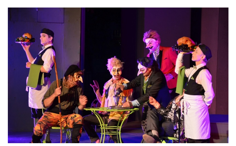
Odyssey Theatre production

• Odyssey Theatre - If they are back this summer, so are we - starting in late-July through August