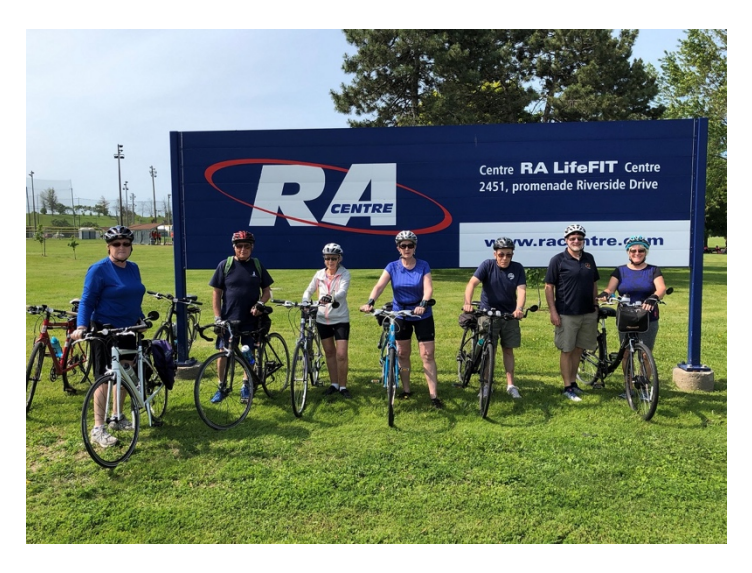
June 2019 – Starting out for Lac Leamy