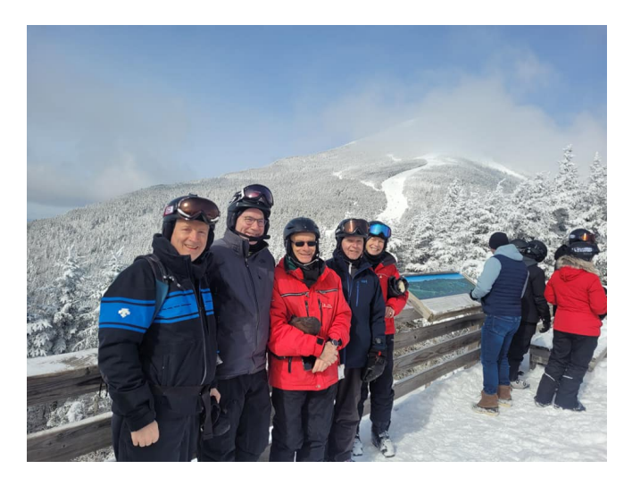
Feb. 2023 - Mid-week at Lake Placid