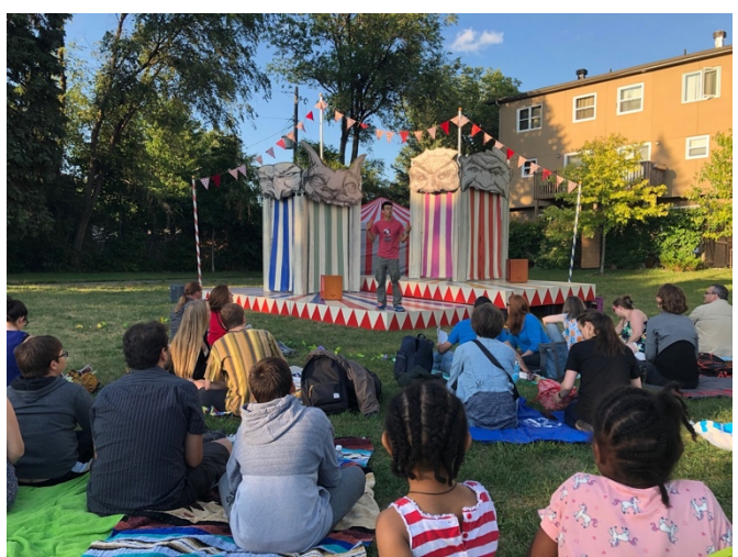
Company of Fools

• Company of Fools - Our annual trek to Shakespeare in the Park sometime between July 3rd and August 26th. The Company of Fools always does one of Shakespeare's plays in a humorous way.