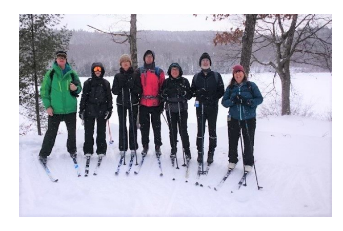
Dec. 26 – Taylor Lake trail

We plan to add some more day trips for next season, so tell us about your favorite routes, or trails that you have always wanted to try. We are also looking for more trip leaders. Thanks to those who have already sent in some suggestions.