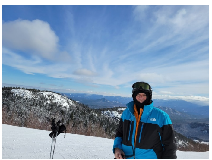
Feb. 2323 – DH Skiing at Whiteface mid-week