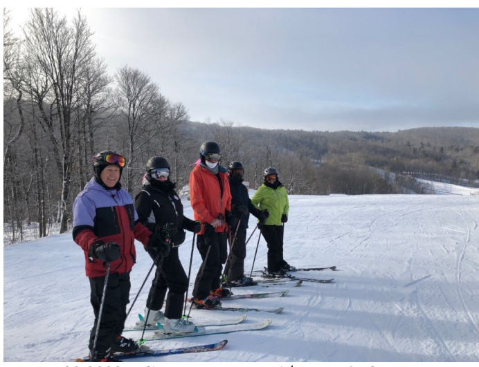
Dec. 20 2022 – Camp Fortune – 1st DH ski of the season