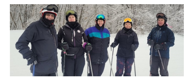
Jan. 9 – Pop-up DH ski at Camp Fortune

We also put "RA Ski Photos of the Week" on our home page raski.ca.