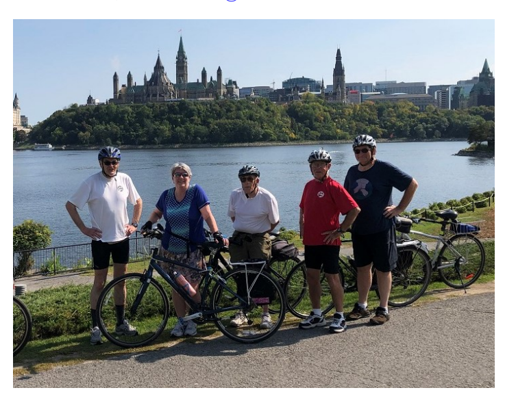
Sept. 2019 – Ice cream crawl