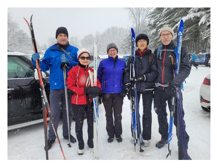
Dec. 17 - Our first XC of the season! P8 to P9

The cross-country ski day trips started off on December 17 in Gatineau Park, the day before the official season opened in the park.