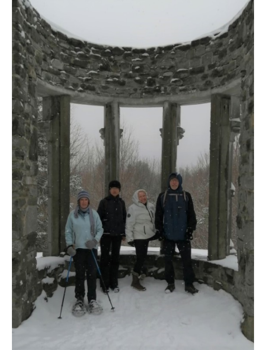
Mar. 16 - 2^{nd} part of our Biathlon