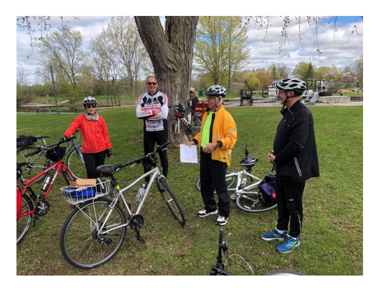
May 2019 - Roger's Roddle in Merrickville

Hello RA Ski Club hikers and cyclists! Thanks to our great volunteer leaders, we have a large number of fun bike and hiking outings lined up for the spring, summer and fall of 2023. Be sure to check the RA Ski Website and Facebook page for more specific details – meet-up location, time etc. – and for possible cancellations due to weather.