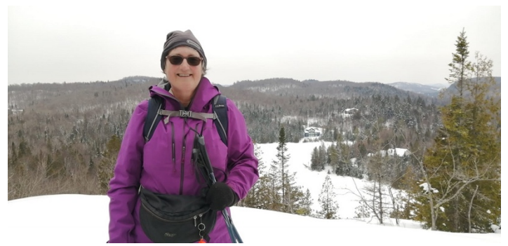
Feb. 2023 – XC skiing at Far Hills Inn