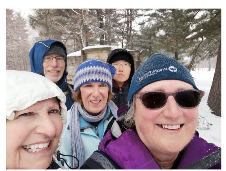
Mar. 16 - Participants in our 2023 Biathlon