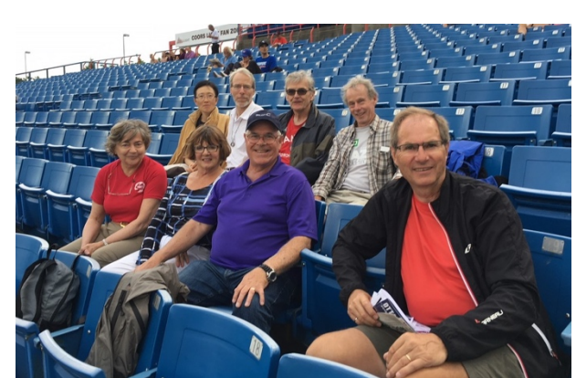
Watching a baseball game