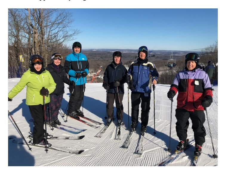
Feb. 14 – Meet'n'Ski at Camp Fortune

The choice destination this year was Camp Fortune, as it seemed to have the most runs open earlier in the season, and was fully open ahead of most other hills. Quite a few of our members have season passes there and were taking advantage of any good weather opportunity to get out and ski.